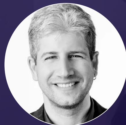
Noam King Worldwide IoT Microsoft